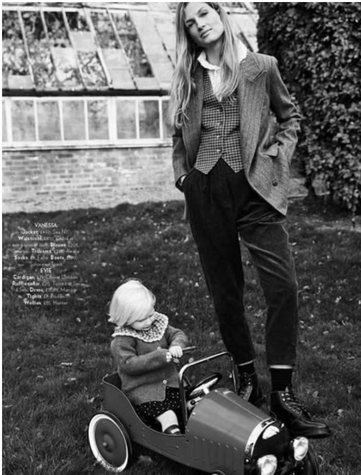
VANESSA Jacket, 1400, 150, 160 Waistcoat, 1400, 150, 160 Blouse, 1200 Trousers, 1200, 1300 Socks, 10, 11, 12, 13, 14 Boots, 1100 Shoes, 1100 EVIE Cardigan, 120, 130, 140, 150 Ruffie collar, 120, 130, 140, 150 Dress, 1200, 1300, 1400 Tights, 10, 11, 12, 13, 14 Waders, 110, 120