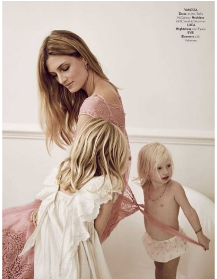
VANESSA Dress, 1100, 1200, 1300 McCartney Neckties 1470, Sarah & Sebastian LUCA Nightdress, 110, 120, 130 EVIE Bloomers, 110, 120, 130 Vahuteen