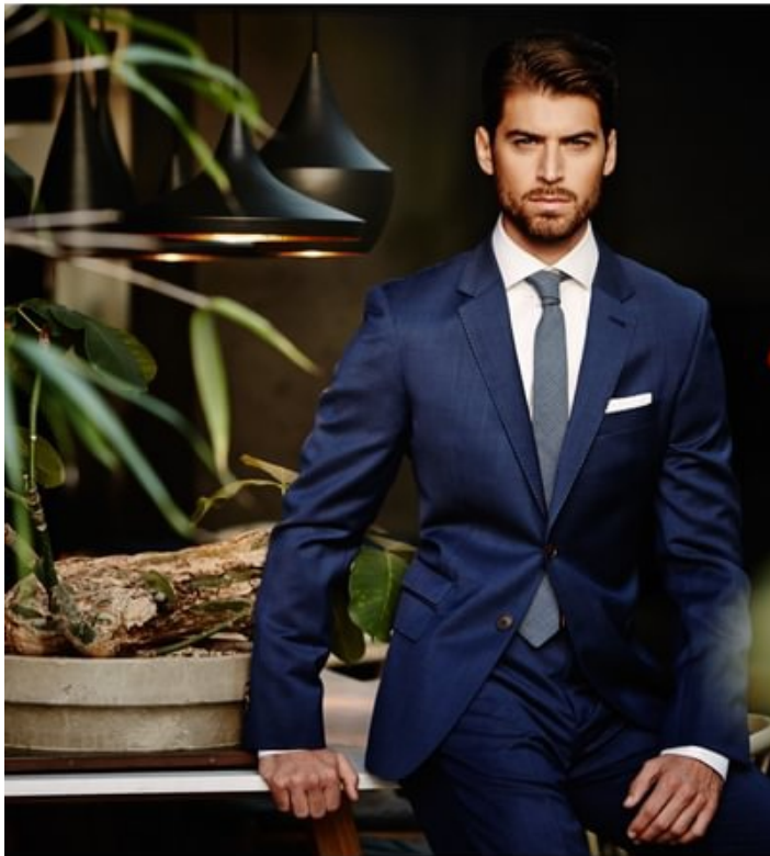
Circle of Gentlemen